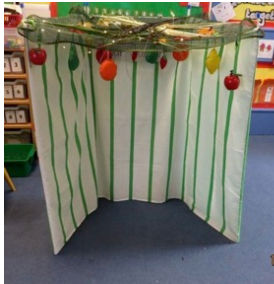
Jewish festival of Succot