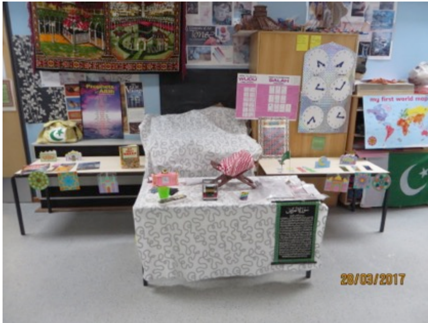
Mosque in a School