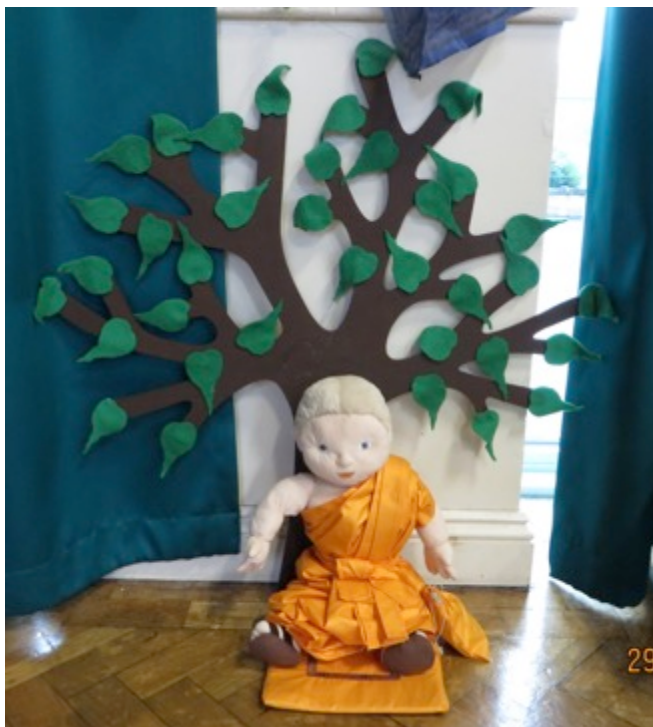
Buddha under Bodhi tree