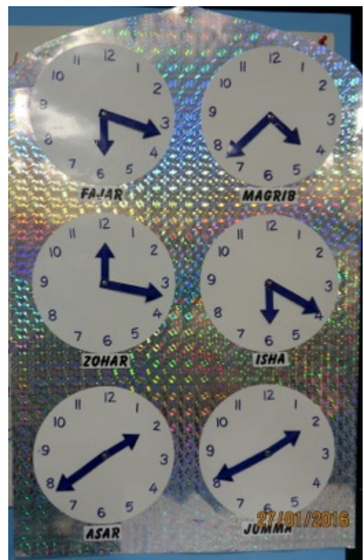
Clocks in the Mosque