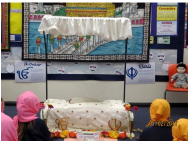
Gurdwara set in a school