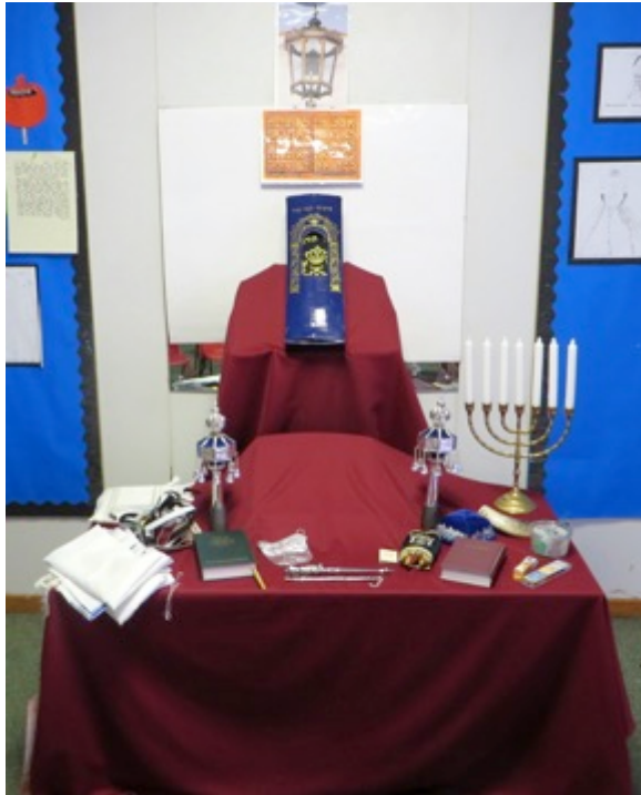
Synagogue in a school