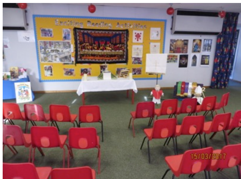
Church in a school